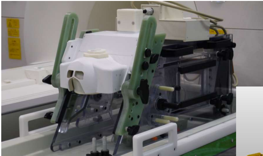
24ch-Array Coil split housing